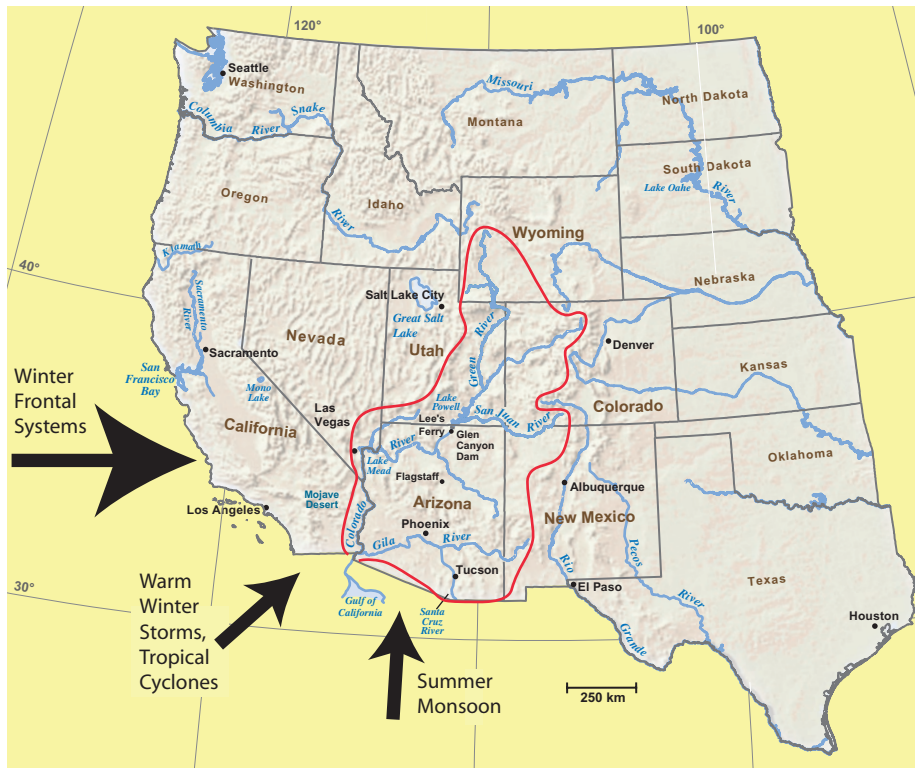
Figure 1. Moisture sources to the Colorado River basin.

Precipitation is biseasonal (winter and summer) in the Colorado River basin (Fig. 1) on the Colorado Plateau (Hereford and others, 2002). In the headwaters precipitation is evenly distributed across the four seasons, mostly accumulating in snowpacks. Moisture comes from several sources (Fig. 1). Frontal systems in winter and spring originate in the North Pacific Ocean and provide the largest and most important source of moisture. These systems tend to carry moisture at high levels in the atmosphere, and precipitation is orographic, meaning it increases with elevation in the mountainous West. Cold frontal systems produce substantial amounts of snow above about 5,000 feet and rainfall at lower elevations in the Rocky, Uinta, and Wind River Mountains, which are the headwaters of the Colorado River and its principal tributary, the Green River.