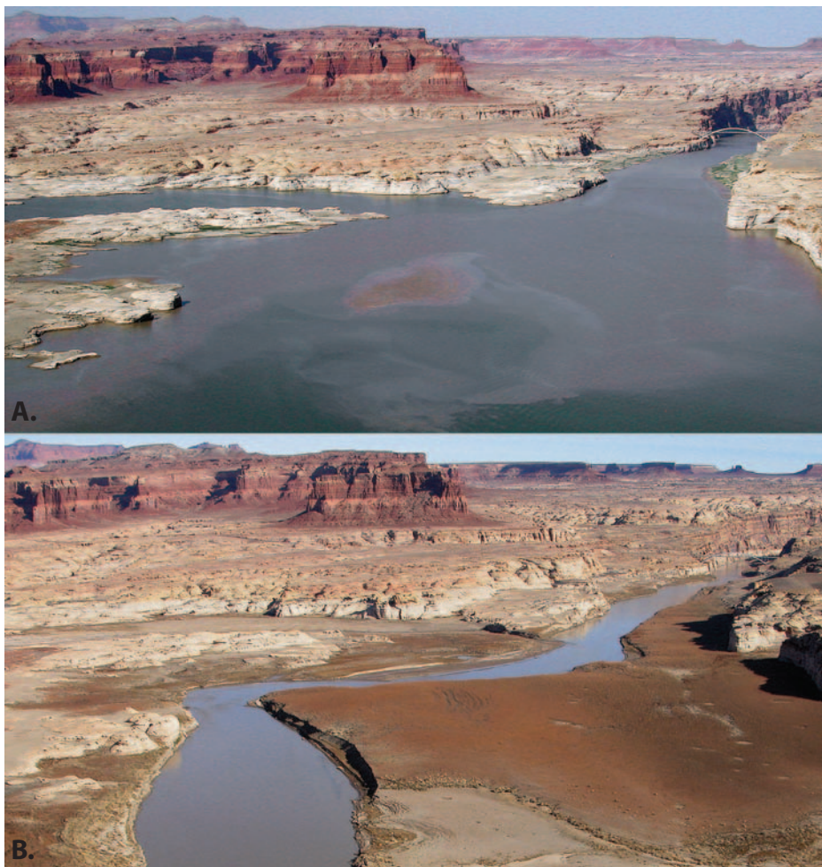
Figure 2. Replicate photographs of Lake Powell at the confluence with the Dirty Devil River (entering from left). A. June 29, 2002. B. December 23, 2003. (Photographs by John C. Dohrenwend.)

The Southern Oscillation Index (SOI) is used to indicate the status of ENSO (Webb and Betancourt, 1992; Cayan and others, 1999). As its name implies, ENSO reflects an oscillation between two basic states of the ocean. The warm phase (negative SOI), called the El Niño, involves warming of the eastern tropical Pacific Ocean off the coast of Peru. The warm water spreads northward in the eastern North Pacific Ocean off the west coast of the United States. The cold phase (positive SOI), called La Niña, is the opposite, resulting in a cooling of the water off western North America. A neutral condition intervenes for several years between the two end states (Fig. 3A).